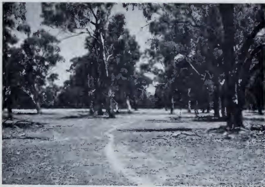
Typical Eucalyptus camaldulensis on Ulupna Island Reserve.